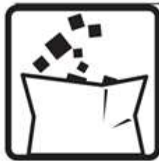
Waste should be disposed of according to local regulations