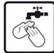
Rinse in cold water before washing