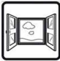
Ventilate working area if possible

"The mechanical effect of fibres in contact with skin may cause temporary itching"