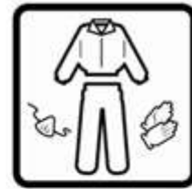
Cover exposed skin. When working in unventilated area wear disposable face mask