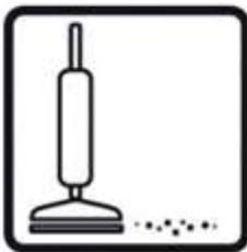
Clean area using vacuum equipment